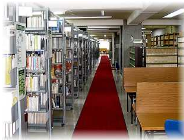
Reading room (Open-stacks) ( 2 F )

URL: http://echobox.hp.infoseek.co.jp/echobox.html