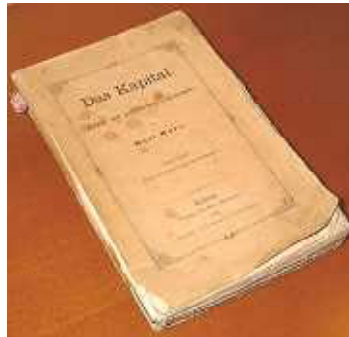
Karl Marx, Das Kapital , Bd. 1. Hamburg, 1867 O 4.2||2502||83779 ( no Collection )